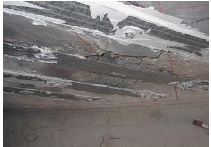
Severe deterioration prevented the application of a bonded strengthening system to this bridge in Pulaski County, Missouri, but MF-FRP applied SAFSTRIP® was able to repair the bridge.