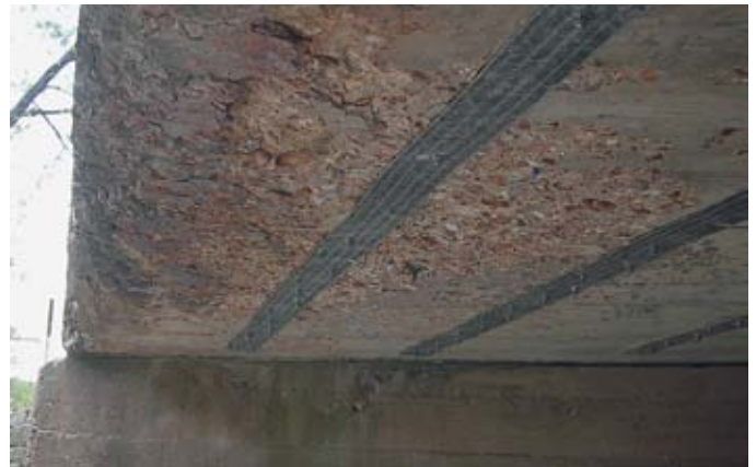
As a result of a SAFSTRIP® retrofit, the existing 12-ton load posting for this bridge in Phelps County, Missouri, was removed.

3 Modulus design values are not reduced in accordance with ACI 440.2R-02